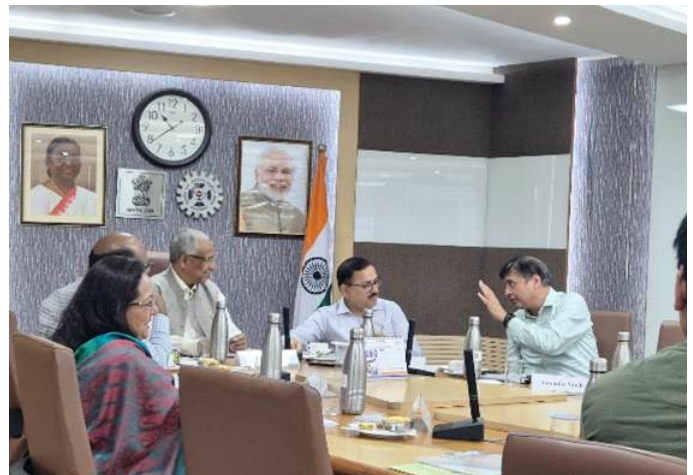
CEO-ASCI delivering Key Insights during the meeting