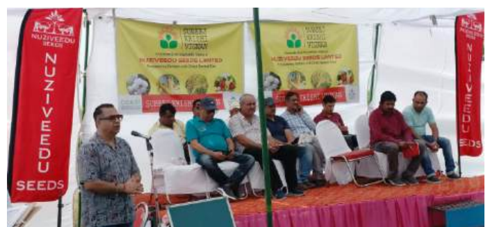
CEASI and Nuziveedu Seeds hosted Farmers Field Day Program in Sonapat, Haryana

In Uttar Pradesh, CEASI hosted a residential program for Board of Directors of Farmer Producer Organizations (FPOs). This training aimed at strengthening leadership skills within the FPOs and promoting the adoption of innovative agricultural practices, ensuring long-term growth and sustainability for farming communities.