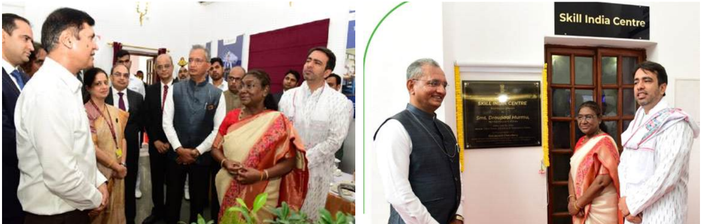
Inauguration of Skill India Centre, Rashtrapati Bhavan by Smt. Droupadi Murmu, Hon'ble President of India

The Skill India Centre at Rashtrapati Bhavan was inaugurated by Hon'ble President of India, Smt. Droupadi Murmu, marking an important step in advancing skill development in agriculture. The centre, established under the Pradhan Mantri Kaushal Vikas Yojana (PMKVY) aims to equip permanent and contractual gardeners with modern techniques and knowledge through skill-based programmes.