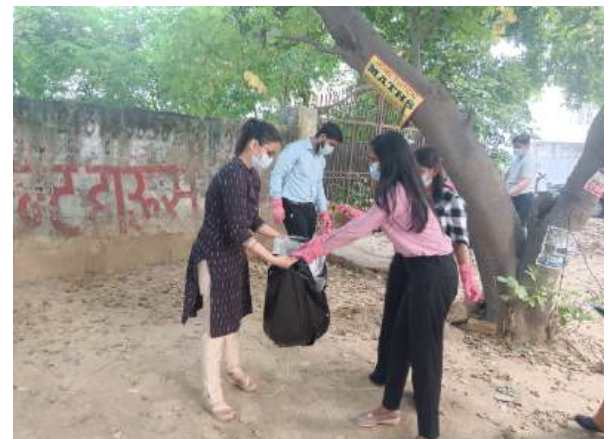
ASCI Team participating in Swachhata Hi Seva Initiative