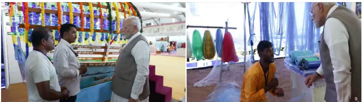
Hon'ble PM interacting with Fishing Net Makers

During the event, Hon'ble Prime Minister Shri Narendra Modi Ji interacted with Fishing Net Makers, gaining valuable insights into their specific challenges and needs. This engagement exemplifies the PM Vishwakarma commitment to addressing the diverse requirements of artisans across India. The Hon'ble Prime Minister also distributed identity cards and certificates to one lakh PM Vishwakarmas, reaffirming the government's dedication to fostering the growth and development of artisans, thereby ensuring a brighter future for India's traditional craftsmen.