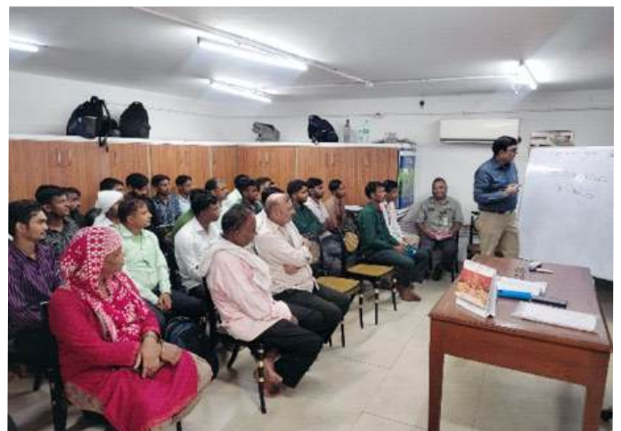
Training of Amrit Udyan Gardeners, Rashtrapati Bhavan

This initiative reflects the government's commitment to advancing skill development in Agriculture sector. It also highlights the role of public-private partnerships, with ASCI playing a pivotal role in shaping programmes tailored to the needs of specific industries.