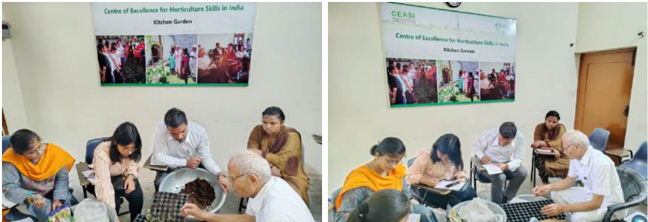
CEASI organised a Smart Nutrition Garden demonstration at Karnal, promoting kitchen gardening for sustainable nutrition

In Haryana, CEASI has focused on educating farmers on the benefits of Direct Seeded Rice (DSR), an environmentally responsible farming method. A series of workshops and field days have engaged farmers in discussions around the method's advantages, such as water conservation and reduced methane emissions. These efforts are paving the way for more sustainable rice farming practices in the state.